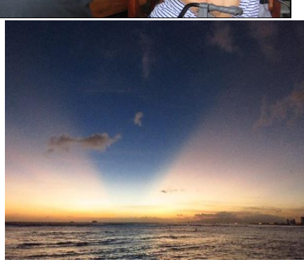
9.21.2k15...The horizon on the Fall Equinox. Ka māuiili o ka hā'ulelau